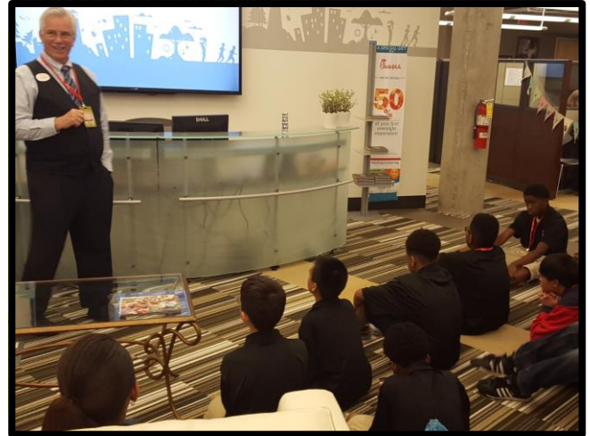
Digital Citizenship, STEM Wars, and our exploration STEM careers in the Food Industry